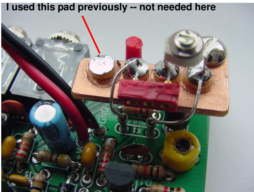
Figure 2. Note use of DIP pins at X1 used as a crystal socket. Also the 3-pin section of DIP pins used on the VXO Support.

Keeping within the range where the power output stays constant, the offset, as close as I can measure, is 547 to 686 Hz.